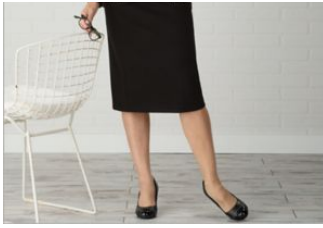
Houndstooth Print Skirt Set by Brownstone Studio® $139.99