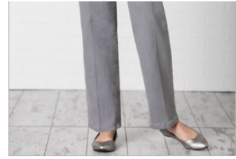
Slimtacular® Platinum Diamond Denim Pants $89.99 - $95.99