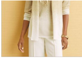
Ombre Shimmer Cardigan $69.99 - $75.99